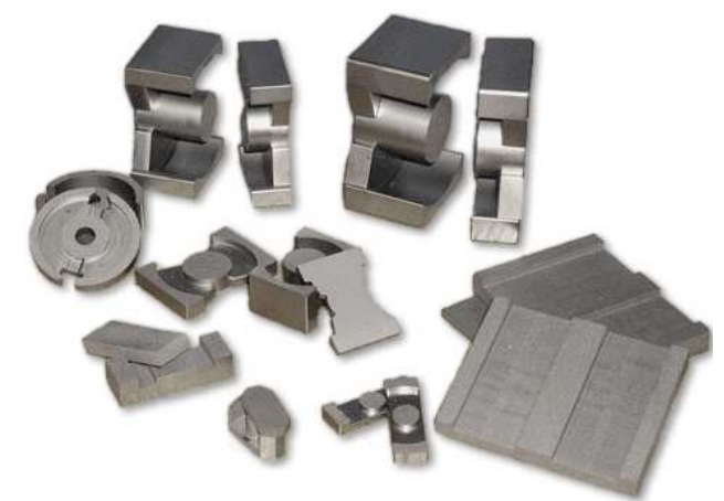
Figure 2. Planar Ferrite Cores

Planar cores are available in various shapes and sizes. The most popular is the planar EE or El core. Other cores include low profile planar versions of standard cores such as RM, ER, PQ and pot cores, Figure 2 .